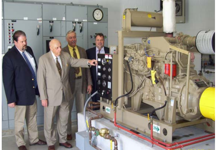
Commissioners and Supt. Dahlem inspect the emergency generator at a District pump station

It's probably not a surprise, but electrical costs are one of our highest expenses. Our annual energy bill is over $150,000 per year. However, last summer the District joined a cooperative effort with 12 other water suppliers on Long Island to participate in an energy demand reduction program. Under this program, the Water District would receive a cash rebate if we were able to reduce our electrical usage during peak demand days, when LIPA is having difficulty meeting the energy demands on Long Island. Because the Water District maintains emergency generators at several of our plant sites, we are able to disconnect from the LIPA system and generate our own electricity. The District received a total of $12,000 in revenue for participating in this program in 2006. In addition, by participating in the program, LIPA and the other power utilities within New York State may reduce the need to build additional power generating plants.